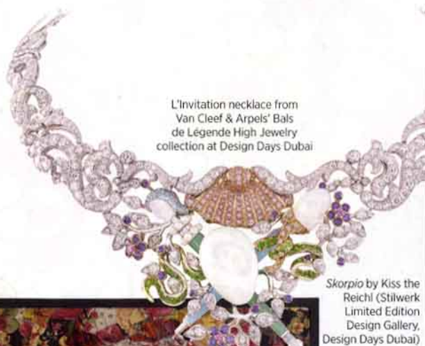
L'Invitation necklace from Van Cleef & Arpels' Bals de Légende High Jewelry collection at Design Days Dubai