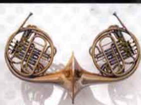
A piece at Gallery Isabelle Van Den Eynde