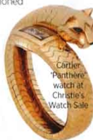
Cartier 'Panthere' watch at Christie's Watch Sale