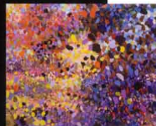
A work by Samia Halaby at Ayyam Gallery